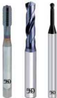
TAP DRILL BALL END MILL